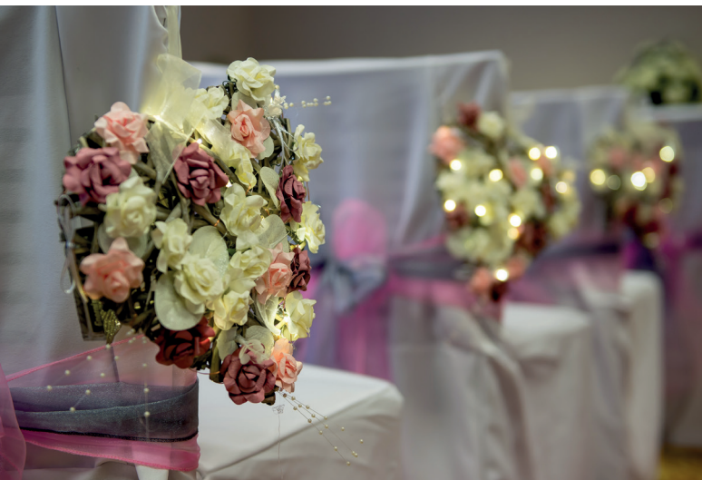
Top; photography courtesy of David Webb North East Wedding Photographer Bottom; photography courtesy of S Howard Photography Ltd